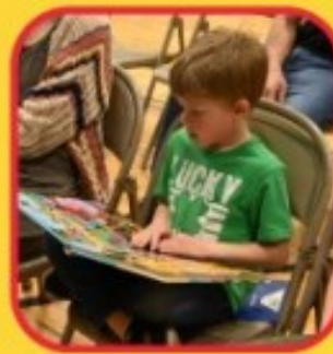
Book for every child