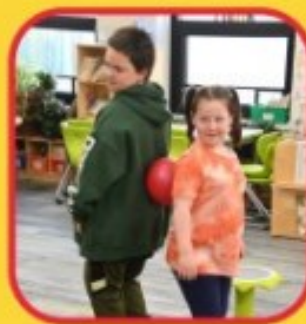
Fun hands-on activities